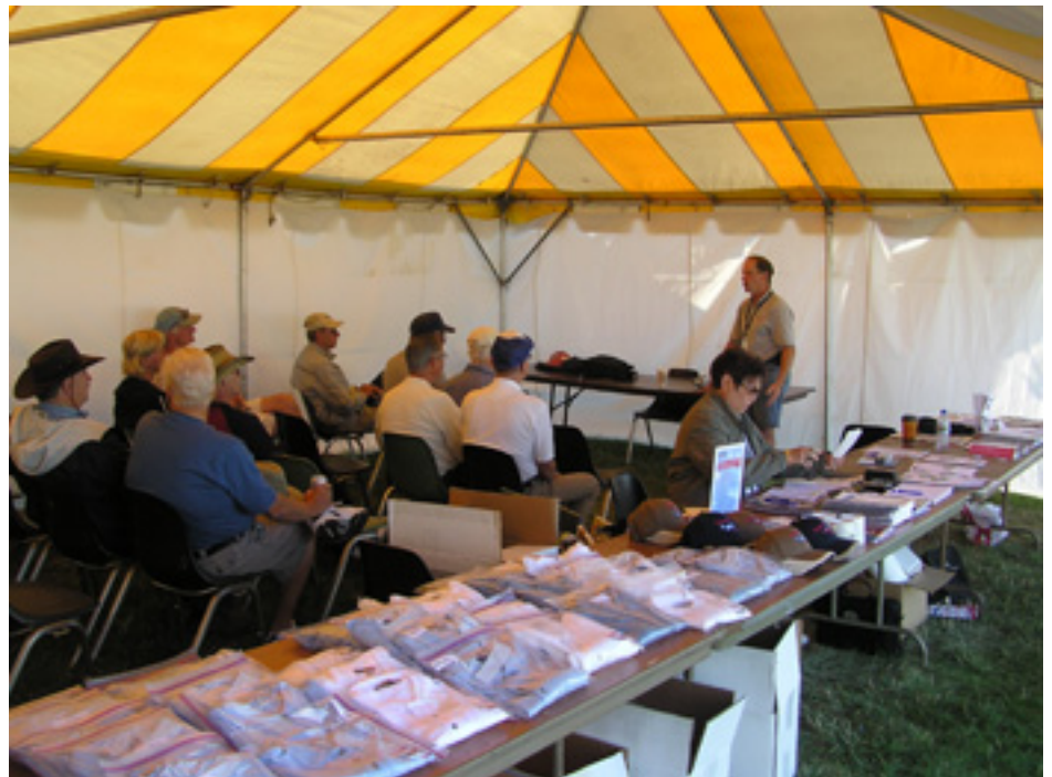
CFF & ICS Maintenance Seminar Oshkosh Airventure 2009